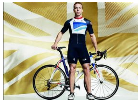
London 2012 Olympics

Oh dear! Olympians get the blues about Team GB London 2012 kit