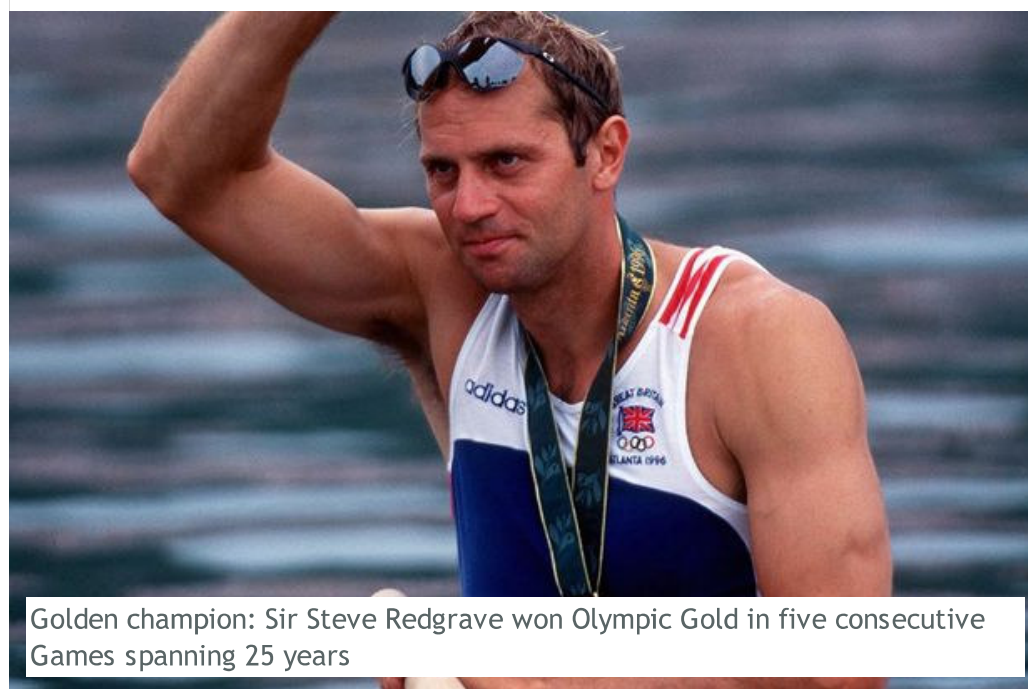
Golden champion: Sir Steve Redgrave won Olympic Gold in five consecutive Games spanning 25 years