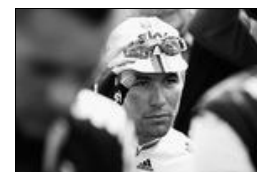
Tour de France

Why my training mantra is "Eat Clean, Train Dirty"