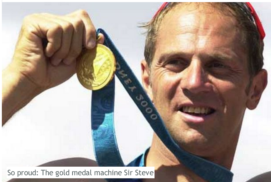
So proud: The gold medal machine Sir Steve

golden era of British rowing,” said Sir Steve on a visit to the Mirror office yesterday.